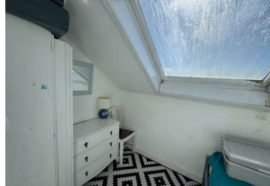
Bedroom 2 6'7" x 8'9" (2.01m x 2.67m)